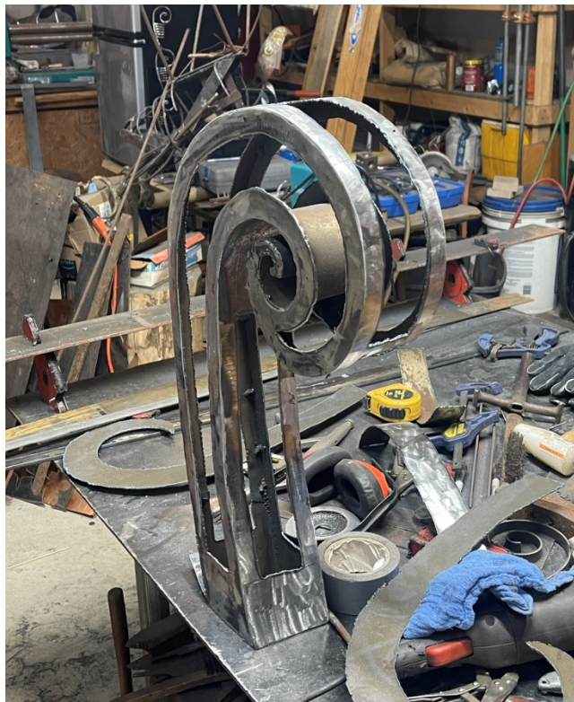
One coil of a staff